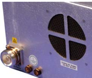
Type 7/16 DIN RF Output Connection to Plasma